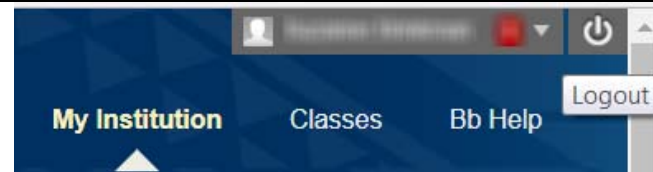
Figure 7 – Logout button in Blackboard